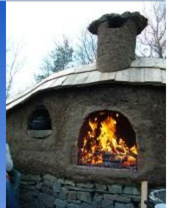
The courtyard cob fireplace at Cwmbwrla Day Centre—built by a group from the centre with Down to Earth.